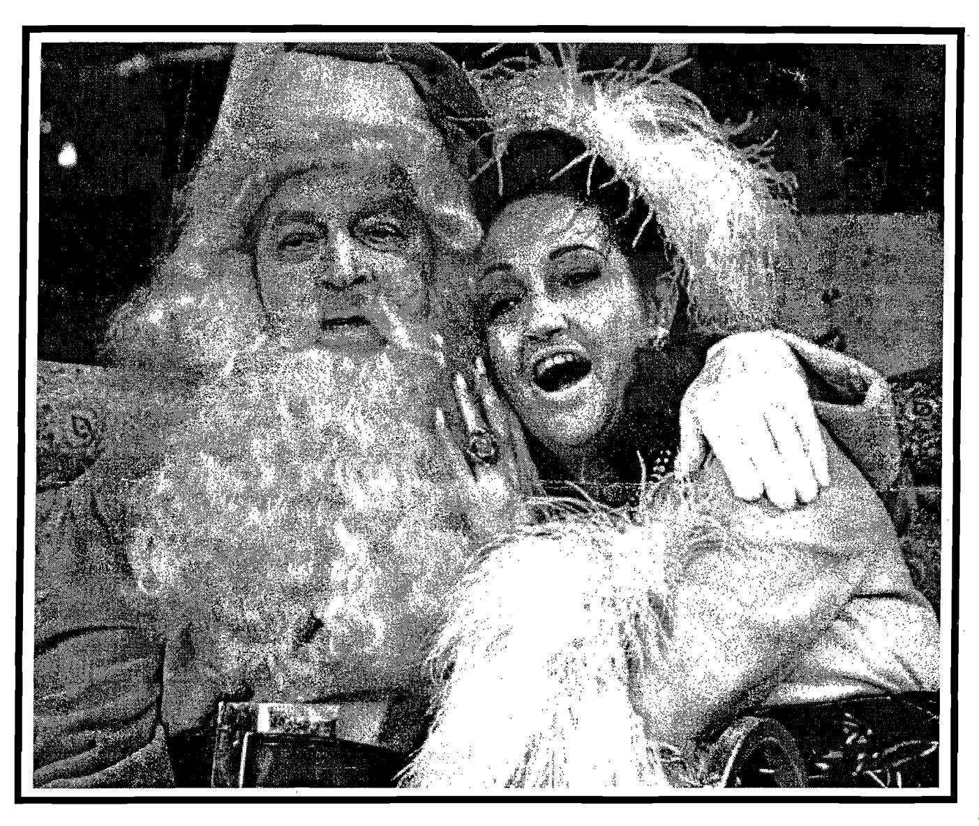
On the Road to Christmas Past